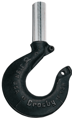
S-319SWG Shank Hook