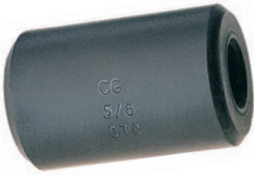
S-409 Swage Buttons