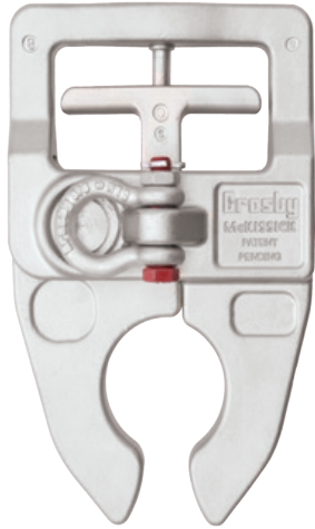
TGRB Tubing Grab