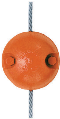
Split Overhaul Ball