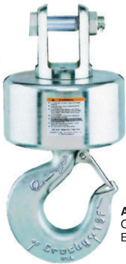
AS-15 Overhaul Ball