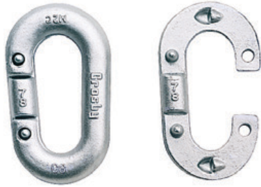
G-334 Replacement Link