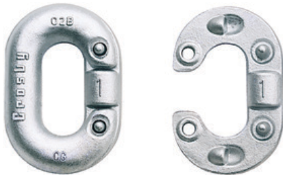
G-335 Replacement Link

* Ultimate Load is 4 times the Working Load Limit. ** Rivets Only - No interlocking lugs. † Has reinforced rivet holes. All sizes have countersunk rivet holes. Not Suitable for use with Grade 80 or Grade 100 chain and chain slings used in overhead lifting.