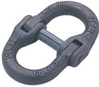
A-336 Connecting Link