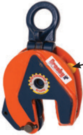
CrosbyIP® Lifting Clamps