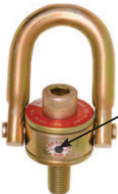
Crosby® Hoist Rings