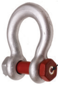
Crosby Red-Pin® Shackles