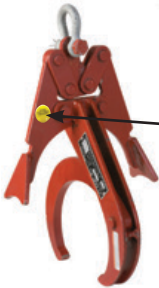
Crosby Clamp-Co® Lifting Clamps