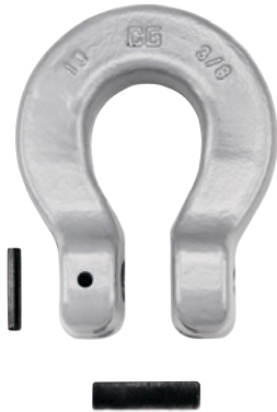
S-1325A Chain Coupler