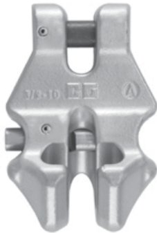
S-1311N Chain Shortener Link

* Minimum Ultimate Load is 4 times the Working Load Limit.