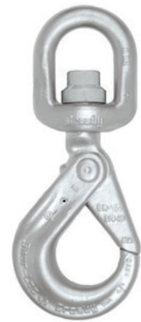
S-13326 SHUR-LOC® Swivel Hook