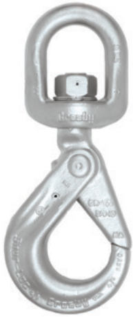
S-1326 SHUR-LOC® Swivel Hook