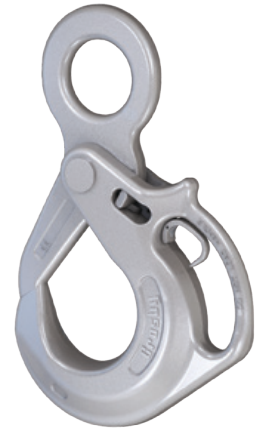
S-1316AH SHUR-LOC® Handle Eye Hook