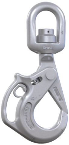
S-13326AH SHUR-LOC® Handle Swivel Hook with Bearing