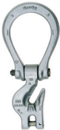
A-1361 Single Hook