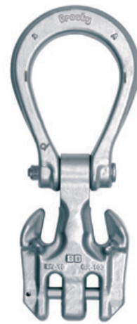
A-1362 Double Hook