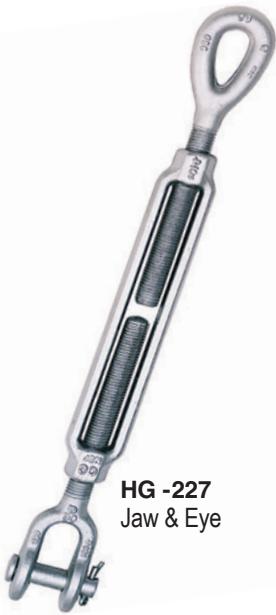
HG-227 Jaw & Eye

Meets the performance requirements of Federal Specifications FF-791b, Type 1 Form 1 - CLASS 8, and ASTM F-1145, except for those provisions required of the contractor. For additional information, see page 452.