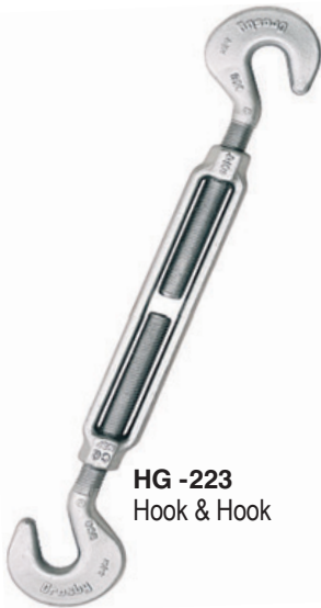
HG -223 Hook & Hook

Meets the performance requirements of Federal Specifications FF-791b, Type 1 Form 1 - CLASS 5, and ASTM F-1145, except for those provisions required of the contractor. For additional information, see page 452.