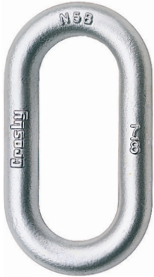
G-340 / S-340 Weldless End Link