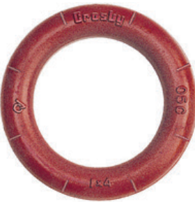
S-643 Weldless Rings

*Ultimate Load is 5 times the Working Load Limit. Based on single leg sling (in-line load), or resultant load on multiple legs with an included angle less than or equal to 120°.