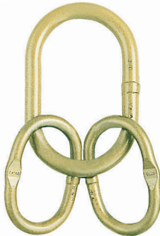
A-347 Welded Master Links

Ultimate Load is 5 times the Working Load Limit. Applications with wire rope and synthetic sling generally require a design factor of 5. Based on single leg sling (in-line load), or resultant load on multiple legs with an included angle less than or equal to 120 degrees. ** Proof Test Load equals or exceeds the requirement of ASTM A952(8.1) and ASME B30.9. For use with chain slings, refer to page 240 for sling ratings and page 245 for proper master link selection.