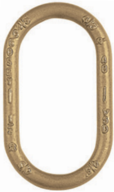
A-342 Alloy Master Links