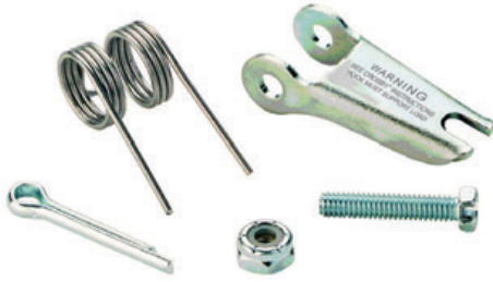
(For Crosby 319N, 320N, and 322N, S-1327, and A-1339 Hooks)