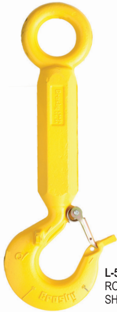
L-562A ROV EYE SHANK HOOK