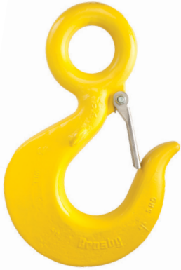
L-320R ROV EYE HOOK