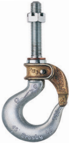
Long Length SHANK HOOKS