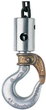
Link Chain Nest