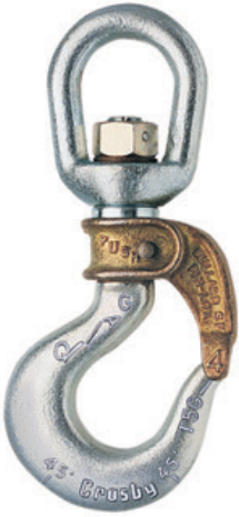
Closed Swivel Bail