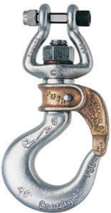
Open Swivel Bail