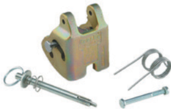
PL-N/O LATCH KITS