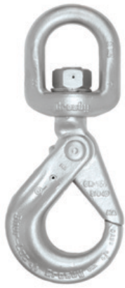
S-1326 SWIVEL HOOK