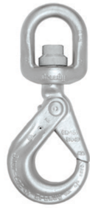
S-13326 SWIVEL HOOK with BEARING