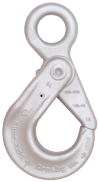
S-1316 EYE HOOK