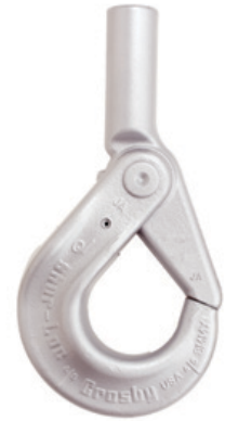
S-1318A SHANK HOOK