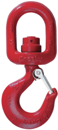
L-3322B Swivel Hooks with Bearing

New anti-friction bearing design allows hook to rotate freely under load.