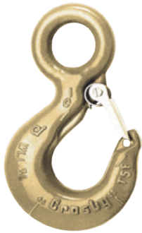
L-320AN EYE HOOK