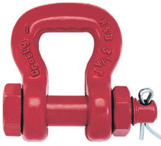
S-252 BOLT TYPE SLING SHACKLE