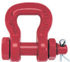
S-252 BOLT TYPE SLING SHACKLE