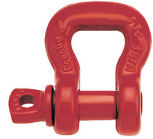
S-253 SCREW PIN SLING SHACKLE