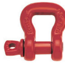
S-253 SCREW PIN SLING SHACKLE